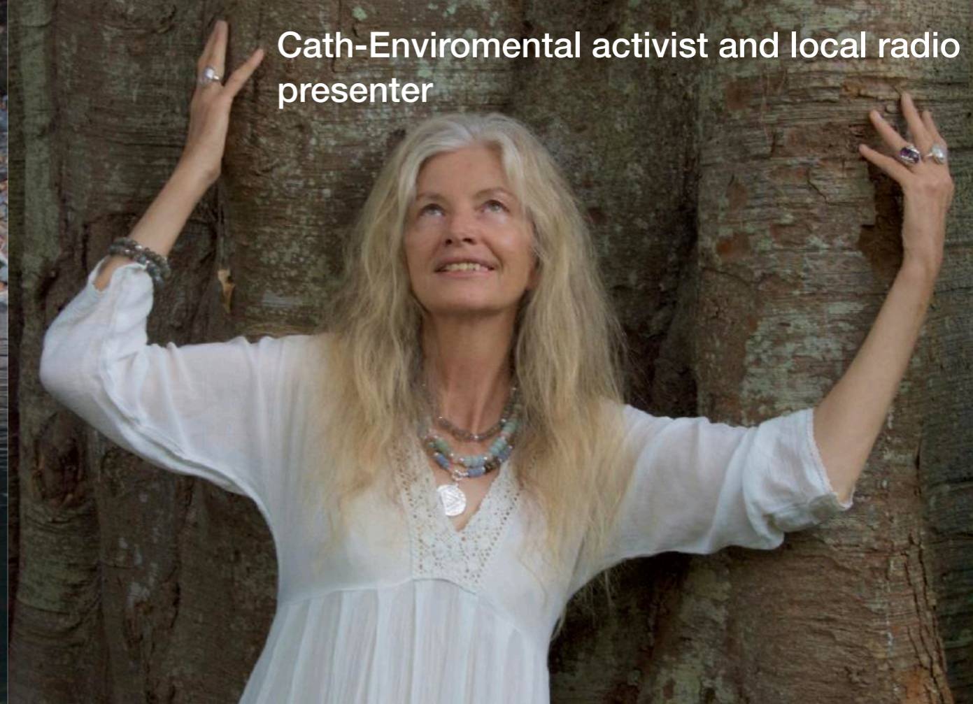
Cath-Environmental activist and local radio presenter